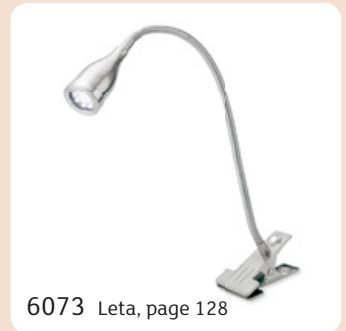
6073 Leta, page 128