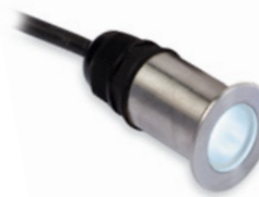
5629 Walkover, page 199