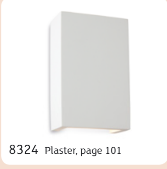
8324 Plaster, page 101