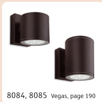
8084, 8085 Vegas, page 190