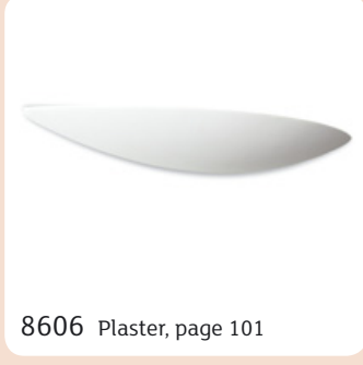
8606 Plaster, page 101