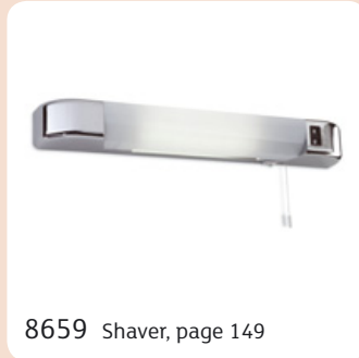
8659 Shaver, page 149