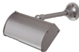
6401 Sign, page 205