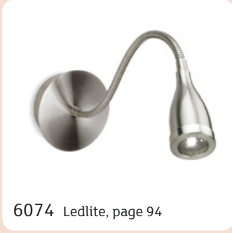
6074 Ledlite, page 94