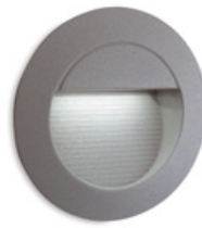
6080 Wall & Step, page 195