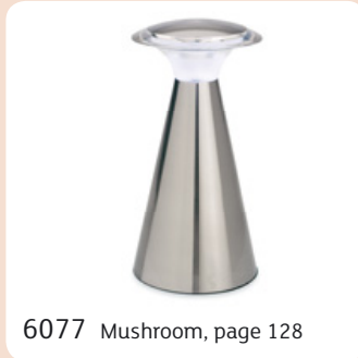
6077 Mushroom, page 128