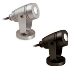
6403 Spots, page 201