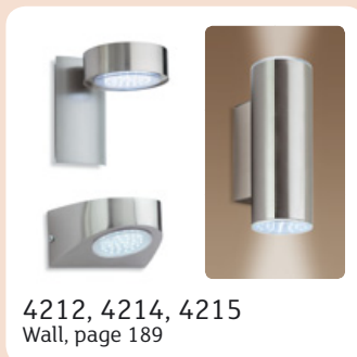
4212, 4214, 4215 Wall, page 189