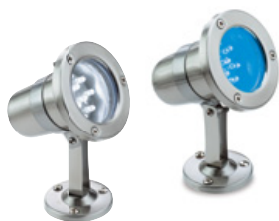
3310 Pond, page 202