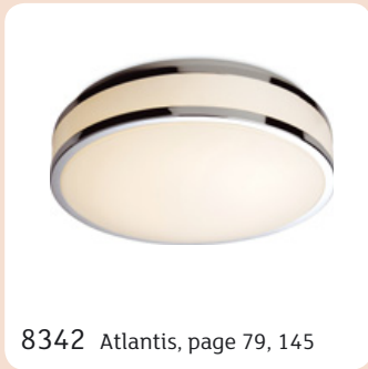
8342 Atlantis, page 79, 145