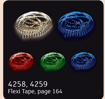
4258, 4259 Flexi Tape, page 164