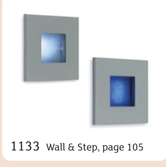
1133 Wall & Step, page 105