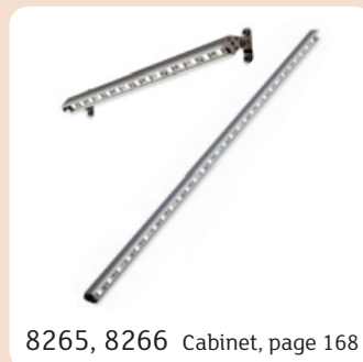
8265, 8266 Cabinet, page 168