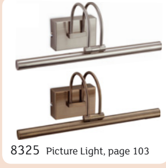
8325 Picture Light, page 103