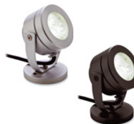
8241 Spots, page 201