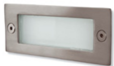
8101 Wall & Step, page 195