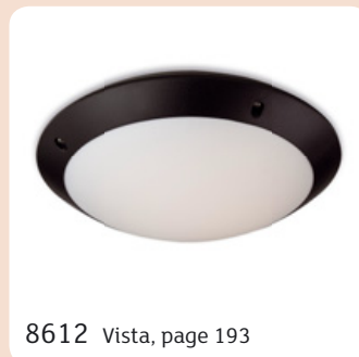
8612 Vista, page 193