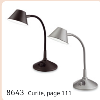
8643 Curlie, page 111