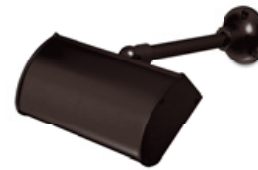
6401 Sign, page 205