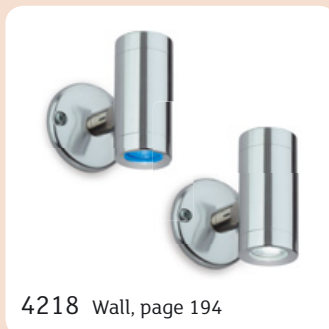
4218 Wall, page 194