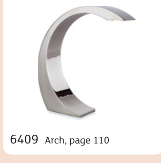
6409 Arch, page 110