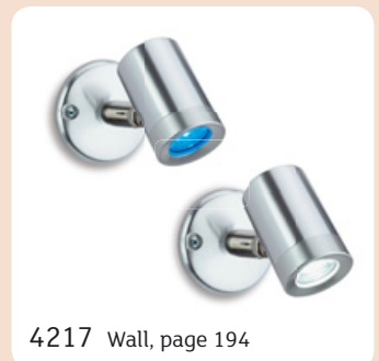
4217 Wall, page 194