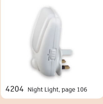
4204 Night Light, page 106