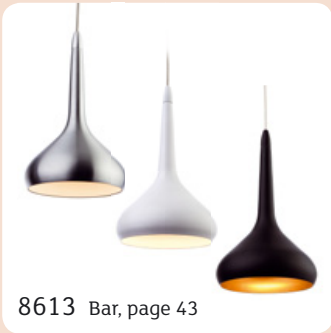
8613 Bar, page 43