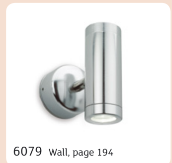
6079 Wall, page 194