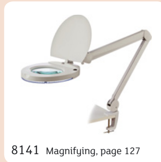
8141 Magnifying, page 127