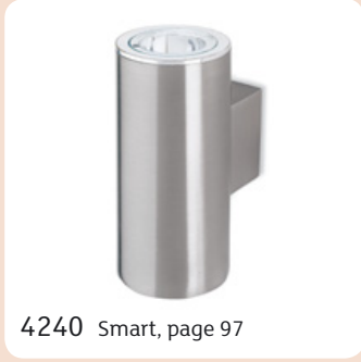
4240 Smart, page 97