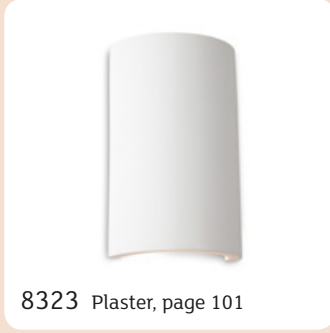
8323 Plaster, page 101