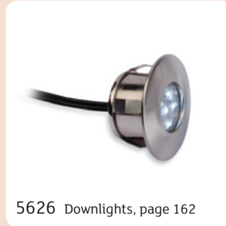
5626 Downlights, page 162