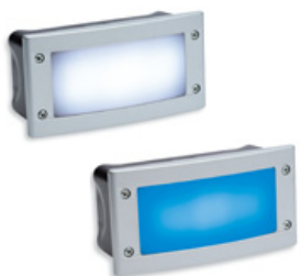
1811, 1813 Wall & Step, page 196