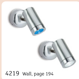
4219 Wall, page 194