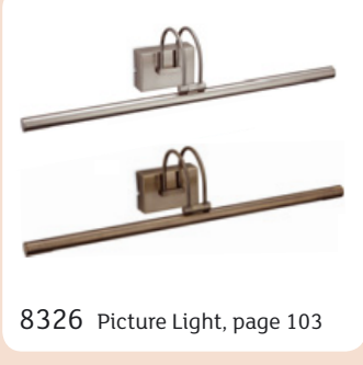
8326 Picture Light, page 103