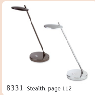
8331 Stealth, page 112