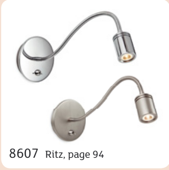
8607 Ritz, page 94