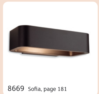
8669 Sofia, page 181