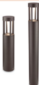
8667, 8668 Delta, page 203