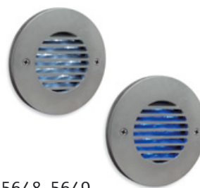
5648, 5649 Wall & Step, page 196