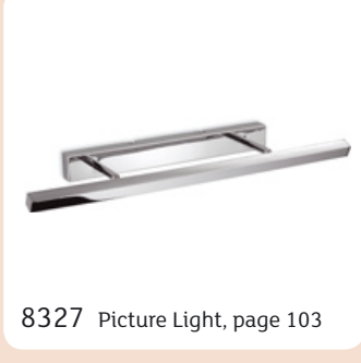
8327 Picture Light, page 103