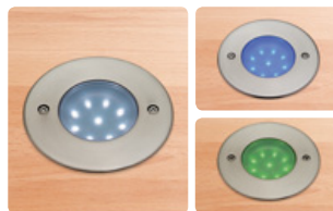
1806 Walkover, page 199