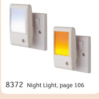
8372 Night Light, page 106