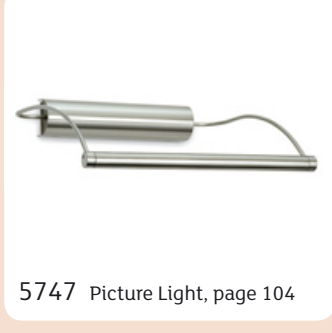
5747 Picture Light, page 104