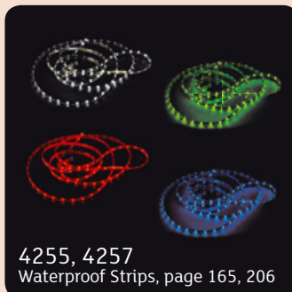
4255, 4257 Waterproof Strips, page 165, 206