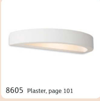
8605 Plaster, page 101