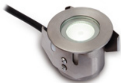
5633 Walkover, page 199