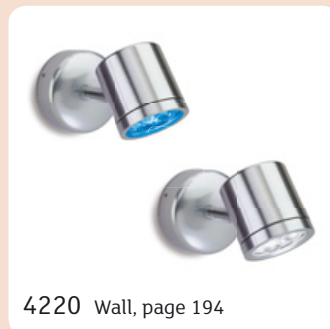
4220 Wall, page 194