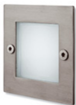
8102 Wall & Step, page 195