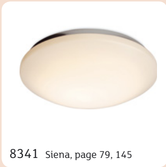
8341 Siena, page 79, 145