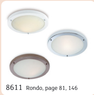
8611 Rondo, page 81, 146