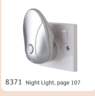
8371 Night Light, page 107