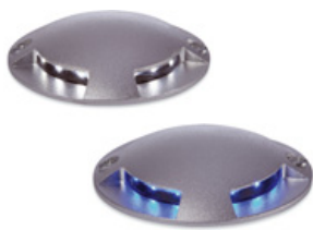
8244, 8245 Walkover, page 200